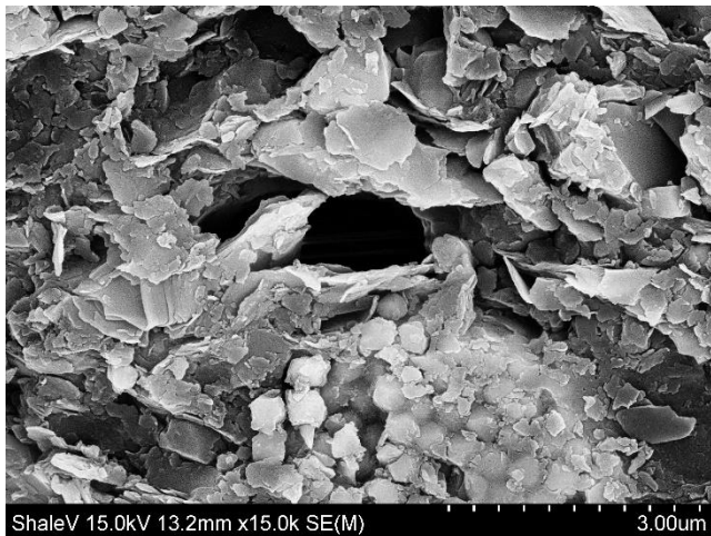
Figure 2. Typical of microstructure of sedimentary rock (shale)

features, intra-granular porosity, anisotropy degree, petrophysical characteristic, mineralogy, thermal history, organic content, location, depth, and so on. of the porous rock and shale are needed [1]. In general, there are no unique parameters for shale.