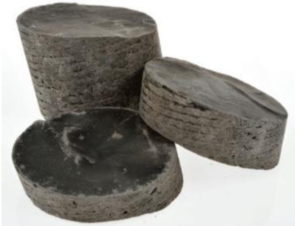
Figure 1: Example of Shale core [2]

features, intra-granular porosity, anisotropy degree, petrophysical characteristic, mineralogy, thermal history, organic content, location, depth, and so on. of the porous rock and shale are needed [1]. In general, there are no unique parameters for shale.