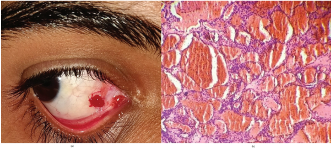
Figure 1. (a) Image showing a bright red, smooth, lobulated mass on the nasal side of the bulbar conjunctiva with tortuous conjunctival vessels at its base. (b) Histopathological evaluation of the lesion showing multiple, blood-filled cavernous spaces surrounded by a fibromyxoid stroma (hematoxylin and eosin, 10x magnification).