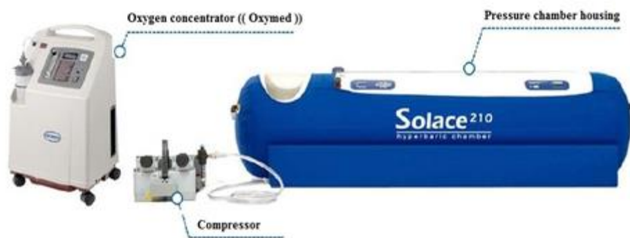
Figure (3). The use of a portable pressure chamber with an oxygen concentrator “Oxymed”.

It should be noted that oxygen therapy can be carried out in a portable pressure chamber, which provides a slight overpressure of up to 1.15 ATA. In this case, it is also advisable to use an oxygen concentrator as a source of oxygen (Fig. 3), which, through a nasal cannula, delivers an oxygen-containing mixture to a patient inside a portable pressure chamber. It is possible to connect an oxygen concentrator to the pressure chamber body and create an increased oxygen concentration inside it up to 35%. In this case, a nasal cannula is not required.