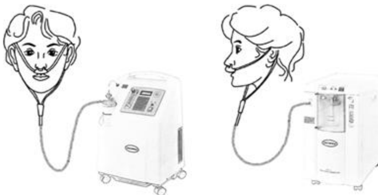
Figure (2). The use of a low-flow nasal cannula with an oxygen concentrator “Oxymed”.

The use of oxygen requires compliance with the regimen and dosage (Table 2). A prerequisite for oxygen therapy is pulse oximetric monitoring of SpO_2 [1].