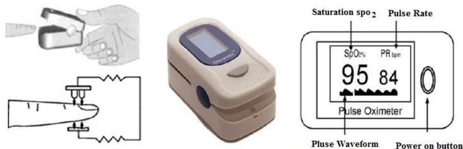
Figure (1). Pulse oximeter “Oxymed”.

One of the most practical methods for diagnosing respiratory failure is the non-invasive measurement of the saturation (saturation) of arterial hemoglobin with oxygen ( \text{SpO}_2 ) using pulse oximetry. This is due to the correlation between \text{SpO}_2 and \text{PaO}_2 . The value of \text{PaO}_2 should normally be in the range of 80–100 mm Hg. Art. This range corresponds to the \text{SpO}_2 normal range of 96–100%. Currently, the \text{SpO}_2 value is determined using a portable pulse oximeter, usually mounted on a finger (Fig. 1).