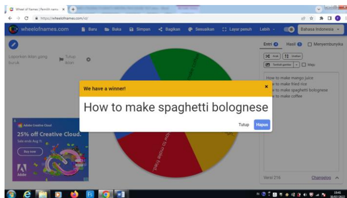
Figure 3. After Spin is turn

The written content is evaluated for a total score that ranges from 0-100 to determine the student's writing proficiency. According to Jacob V. Hughes, who was referenced by Khoiriza (2019), there are five factors that go into the evaluation of the written test. These are: