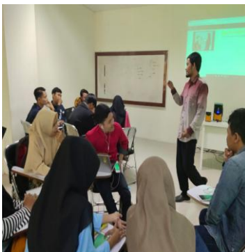
Figure 1. The Process of teaching in class