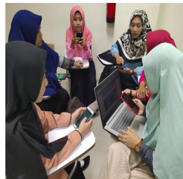
Figure 2. The process of discussing online material