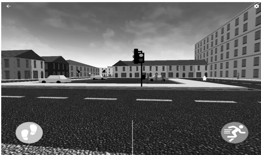
Figure 2. Screenshot of the city from the player's viewpoint, when holding the iPad up vertically in front of them.