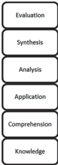
Figure 1. BT v.1 1956 (Bloom, 1956)