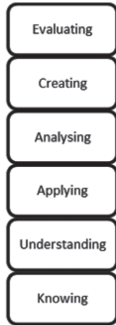
Figure 2. BT v.2 2011 (Komárek & Mareš, 2012)

Bloom's is not the only hierarchical learning scheme in educational psychology that provides the taxonomy of the learning objectives; however, it is the most influential (Callister, 2010). It has been observed that all hierarchical schemes represent an inverted approach, which means that the point of progression is placed at the top level, which in actual should be the point of initiation and at the bottom. Furthermore, these hierarchical models are based on learning that is essential and often nonsensical; determined by the experimenter rather than by the learner, and rely on data collected in controlled experimental conditions (Krathwohl & Anderson, 2010). In the real world, factual learning is the most difficult kind of learning, unless it is embedded in something that is understood