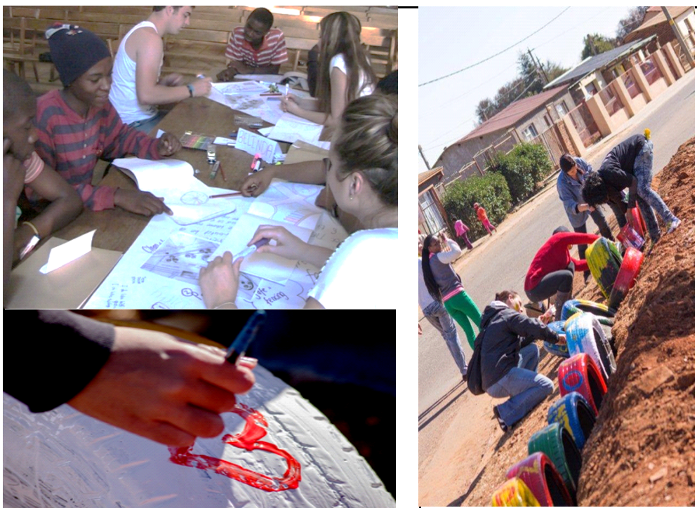
Figure 1: Participants collaborating on project

negotiated between the parties involved. The conversations that took place between the participants in this study were aimed at arriving at common understandings on the given task (developing art work for the park), raising awareness about problems, debating particular issues and collaborating on a final product (Helguera, 2011). In most phases of the process, the conversations between the participants were the core source of meaningful and mutual knowledge generation. In the end, the pragmatic artifacts created reflected an understanding of the real needs of the community members – they painted large tractor tyres which they then embedded in the ground (so they were not stolen) to demarcate the open space and make it attractive to children as a play area (see Figure 1). Thus, through socially engaged art practices, they could agree on a solution that was aptly suited to this particular environment, rather than an abstract piece of art that would probably have been vandalized or stolen.