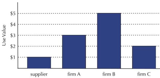
Figure 1: Use value for different firms

In a normal bidding situation, Firm B would purchase the resource as they place the highest use value on the resource ($5). As Firm A can only achieve a use value of $3 from the resource, they would not be willing to bid above this price. Therefore, Firm B would be expected to pay no more than $3 for this resource as this is the maximum that the firm with the next highest use value estimation (Firm A) would be willing to bid.