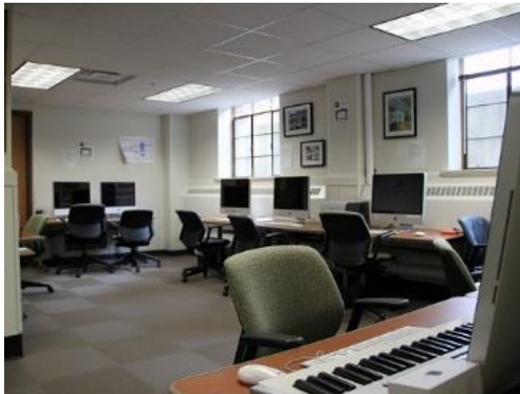
Figure 4. Language and Media Center