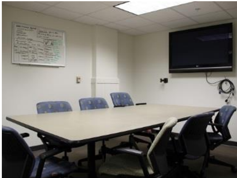
Figure 5. Language and Media Center Conference Room