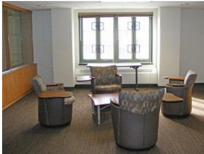
Figure 8. Informal gathering space.