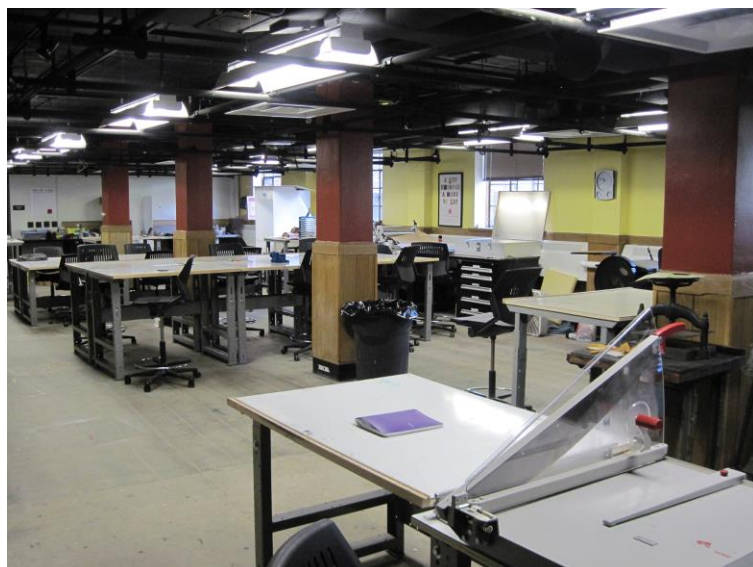
Figure 3. RCAH Art Studio