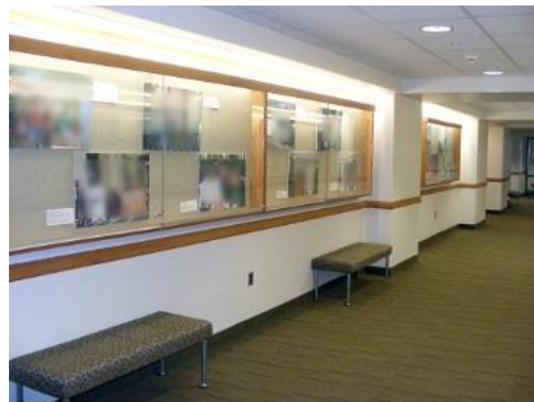
Figure 6. Glass Display Cases, Second Floor Hallway