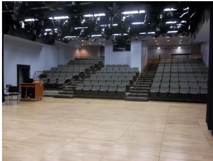
Figure 2. RCAH Theater