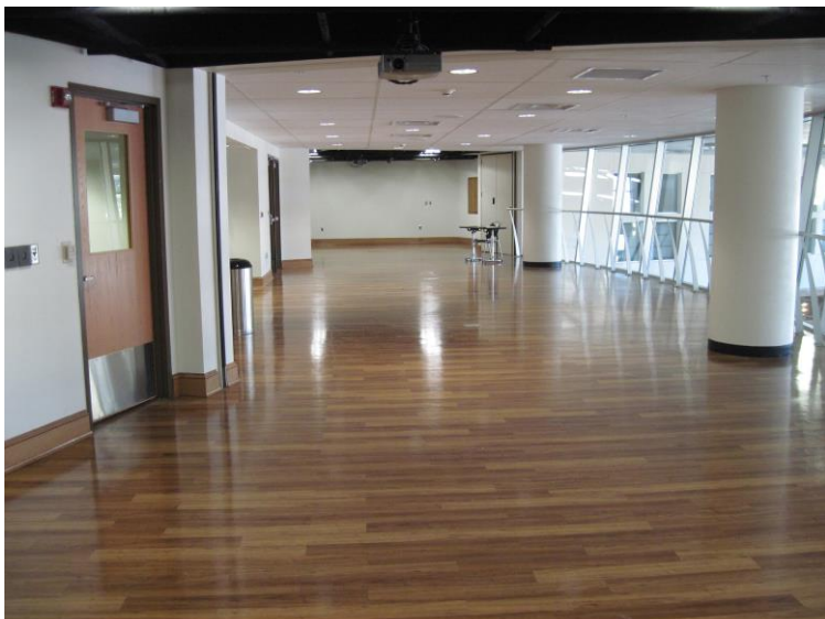
Figure 1. RCAH LookOut! Gallery