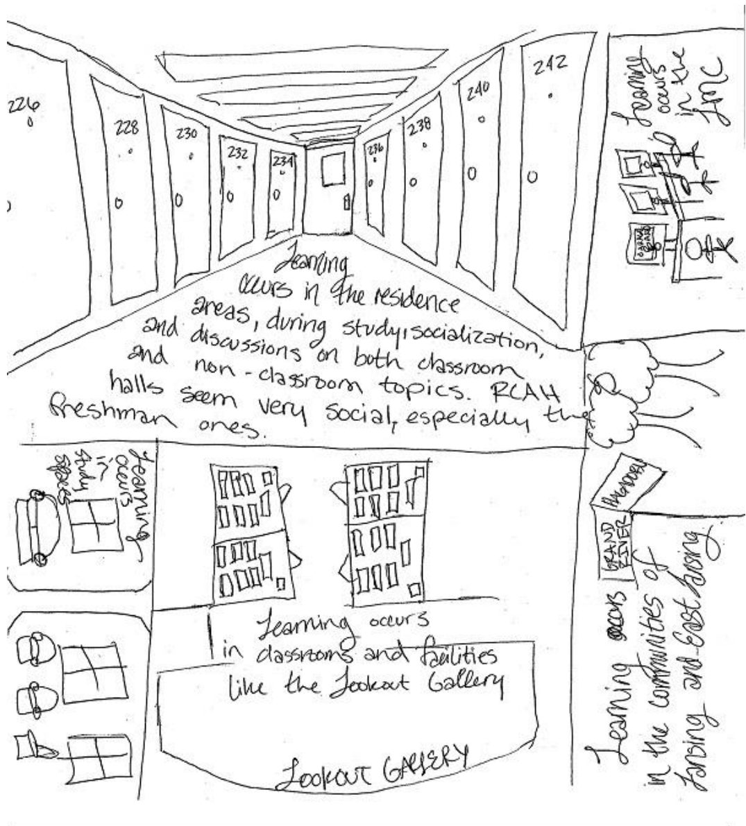
Figure 11. Cognitive map drawn by a student.

Indeed, the sense of connectedness and coherence is so pronounced that the RCAH is sometimes referred to as a "bubble." As one student explained: