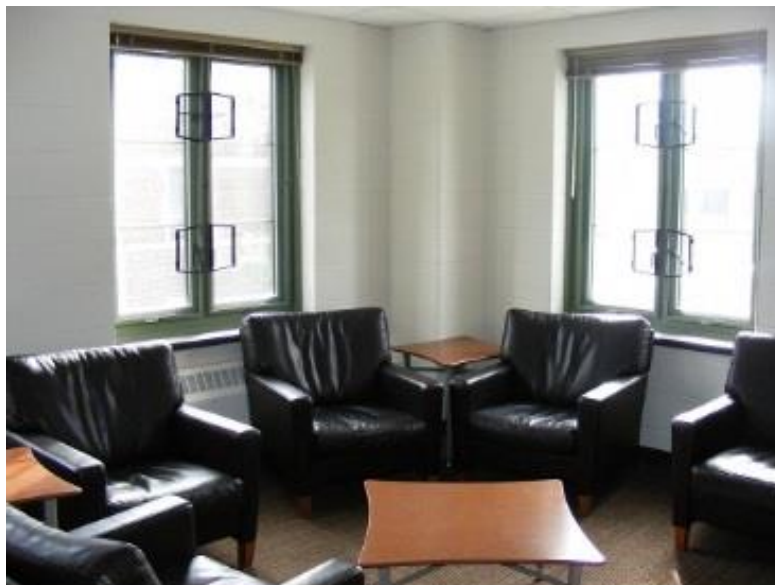
Figure 7. Informal gathering space