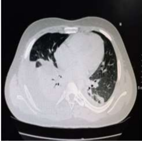
Post Bone Marrow Transplant--- Engraftment Syndrome and Disseminated Fungal Infection