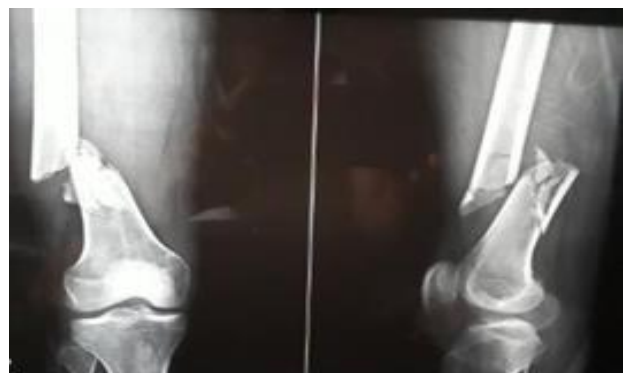
1a-Pre-operative radiographic scan

Radio-graphical presentation of fracture of distal femur at the time of admission and after application of retrograde femoral nail.