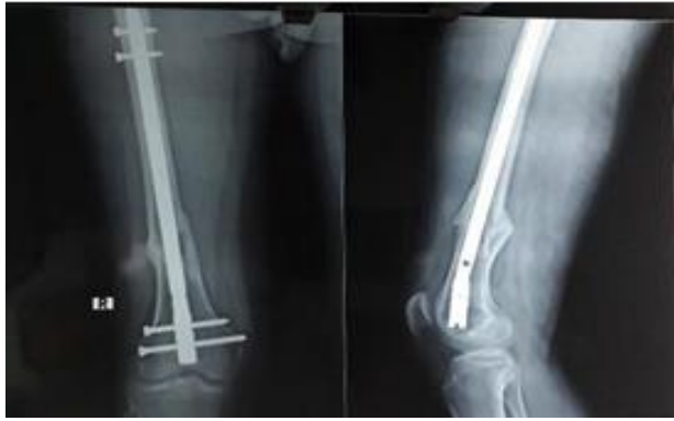
1b- Post-operative retrograde femoral nailing