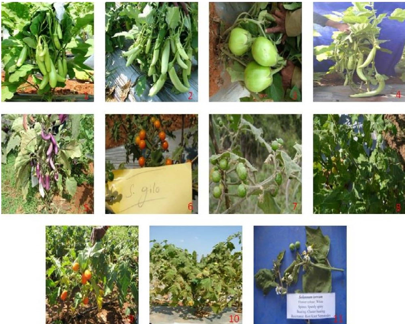
Fig. 1. Eggplant cultivated varieties [IIHR-7 (IC395334), IIHR-662 (CARI-1, IC0585684), IIHR-108 (Arka Kusumakar), IIHR-663 (Rampur Local)] and seven wild species [ Solanum gilo , S. indicum , S. viarum , S. aethiopicum , S. mammosum , and S. torvum ] used for bacterial wilt screening.

In this study, five eggplant cultivated varieties viz., IIHR-7 (IC395334), IIHR-662 (CARI-1, IC0585684), IIHR-108 (Arka Kusumakar), IIHR-663 (Rampur Local), and seven wild species viz., Solanum gilo (RS-3), Solanum indicum (RS-4), Solanum viarum (RS-6), Solanum aethiopicum (RS-7), Solanum mammosum (RS-8), and Solanum torvum (RS-9 and RS-9a) were used for bacterial wilt screening ( Fig.1 ). These germplasm accessions were maintained at Indian Institute of Horticultural Research, Bengaluru.