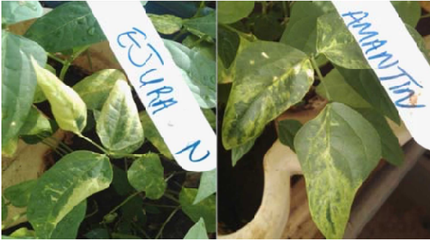
Fig. 1. Mottle mosaic symptoms of seed-borne BCMV-BICM on grow-out cowpea plants in a screen house

All the symptomatic plants of 19 seed lots also gave positive reactions to BCMV-BICM in ACP-ELISA (Table 1). BCMV-BICM transmission based on symptoms among the lots ranged from 0 to 37.8 % (Table 2). Some of the infected seed lots recorded low germination rates. For instance, of the 100 seeds of each seed lot planted, 51 of “Nkoranza-14” and 30 of “Amantin-15,” which were positive to BCMV-BICM, germinated. All asymptomatic plants tested negative to BCMV-BICM in ACP-ELISA (Table 1).