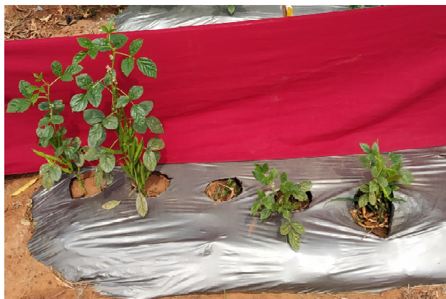
Fig. 3: Variation in plant height obtained in M_2 generation (dwarf mutants)

Whereas, traits like number of clusters per plant, number of pods per plant, ten pod weight and yield per plant revealed non-significant differences among mutants indicating selection for this trait from the mutant population will be ineffective because of predominance of environmental effect. For days to 50 per cent flowering, variation was found significant between mutants but non-significant over checks that means mutants are on par with the checks or they are of late maturing types which is not the objective of the present study. The variation created through mutation for pod length (Fig. 4) was found significant between the mutants and also over checks. It showed low GCV and PCV but high heritability coupled with moderate genetic advance. Selection would be effective for this trait because of higher heritability and moderate genetic advance due to additive gene