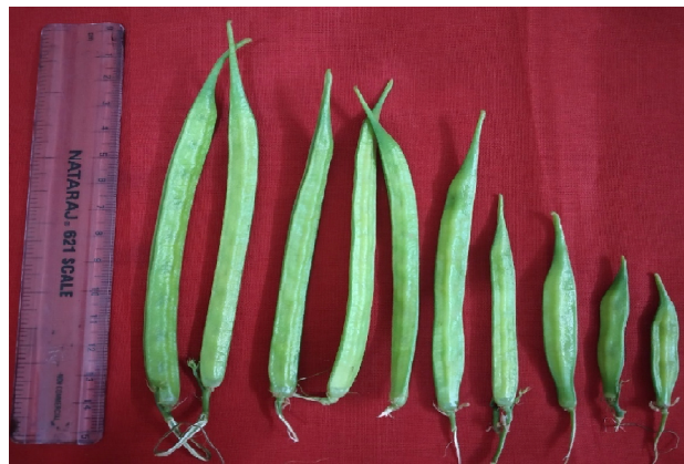
Fig. 4: Variation in pod length obtained through mutation in M_2 generation