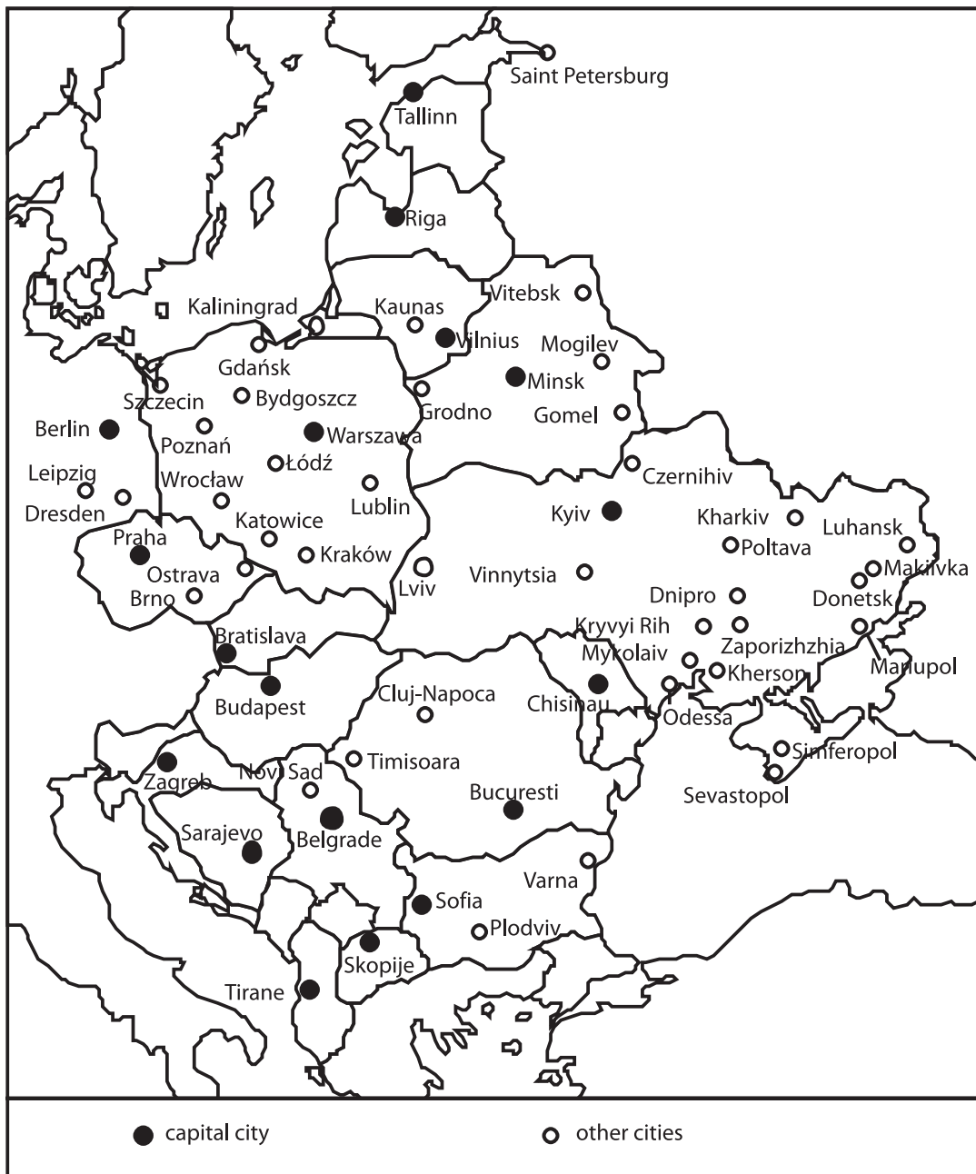
Fig. 1. Analysed cities