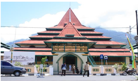
Fig. 14 Kedaton Ternate Mosque in 2014

In the nineteenth century, most of the population of the territory of the sultanate of Ternate had embraced Islam and some were Christian and the primitive belief among the Alifuru people. After the king embraced Islam and accepted it in the government structure, this meant that Islam became a royal religion. Therefore the local authorities must accept the religion of Islam. There was a massive conversion of the religion of ignorance (primitive) into the religion of Islam, especially among the rulers and their families. The ruling treatment of a Muslim population as a first-class citizen and other residents as second-class citizens is a favorable condition for the transition of religion. This is especially true for the inhabitants who inhabit the coastal area and close to the ruling center in the area or the social group of the rulers of the time. Kedaton Mosque Ternate as in the picture below ( http://www.indonesiaheritagenet ).