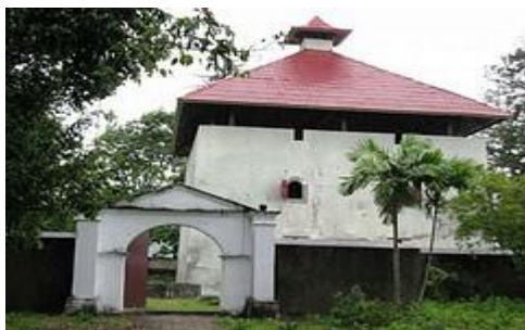
Fig. 11 Kota Naka Fort

The fort was built by the Dutch East Indies government in the 18th century. Located just a few meters to the left of Kedaton (Sultan) Sultan Ternate on a hill. The fort is named after the mention of "Naka" (jackfruit), which according to the community around it is related to the smell of jackfruit that can be smelled from a distance. Have there ever been a jackfruit tree, so far not known with certainty? This is equivalent to the function of this fort, which is to oversee the movements of the sultan in the administration of government in addition to Dutch for. This means that the news of this fort spread more quickly in the community about the condition of the kingdom( https://