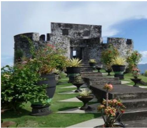
Fig. 2 Toluko Fort