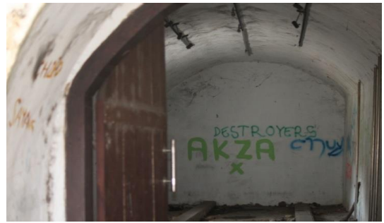
Fig. 5 Rooms in The First Floor of Oranje Fort

The rooms on the first floor along the walls are in a state of concern. At the northwest corner, it has even buried the ground around, making it difficult to identify. In the space of 15.80 m at the gate and on the outer wall there is a pile of brick, which has no context with the fort. Similarly, the condition of the guard building behind the gate, all that remains is debris. Here are some pictures from the site of Oranje Fort that exist at the present moment. Here are some strong images of the fort of oranje built during the Dutch occupation.