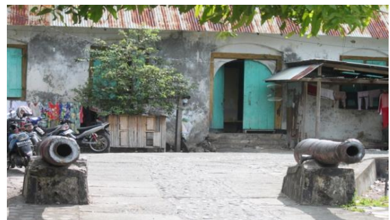
Fig. 8 Condition in Oranje Fort in 2014 (3)