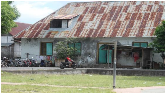
Fig. 10 Condition in Oranje Fort in 2014 (5)

The above five pictures are taken in 2014, showing the current conditions of the Oranje Fort. In terms of building, the material building is made of good quality material even very good because the wall that can be seen at the moment is still the original building. It's just that the fort's surroundings are filled with people's homes and are now in the process of revitalization.