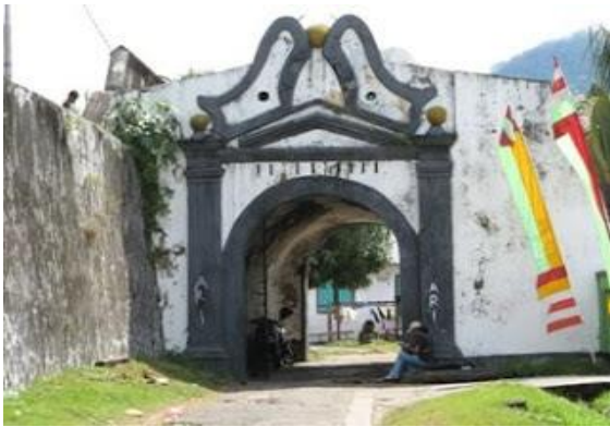
Fig. 4 Oranje Fort

The fort was built in 1607 by Cornelis Matelief de Jonge (The Netherlands) and was named by Francois Wittert in 1609. The fort of Oranje originally came from a former old fort founded by a Malay and was given the name of Benteng Malayo. Inside the fort was once the center of the highest government of the Dutch East Indies (Governor General), namely Pieter Both, Herald Reynst, Laurenz Reaal, and Jan P. Coen. In this fort was once served as the headquarters of the VOC in the Dutch East Indies until Governor-General Jan Pieterszoon Coen moved his headquarters to Batavia in 1619. The fort was able to demonstrate the ability of its defense power against the Spanish attack when the Spanish crossed quietly at night from the fort of Gammalamma (Kastela) through a difficult passage with 250 men arriving in the citadel of Oranje at dawn, can be repulsed by the Dutch in a one-on-one battle. The Netherlands with forty soldiers assisted by about a hundred people of Ternate able to defend the fort. The war in the citadel of Oranje in 1606 turned out to be a serious battle between the Netherlands and Spain in the area.