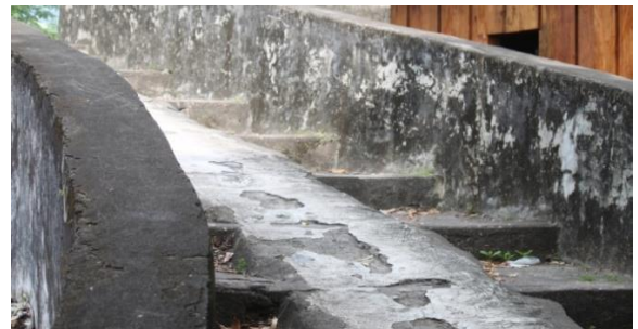
Fig. 7 Condition in Oranje Fort in 2014 (2)