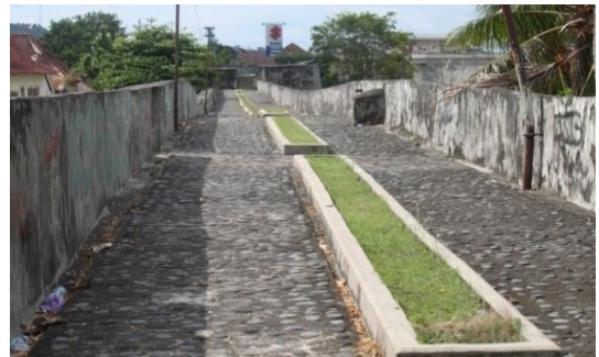
Fig. 6 Condition in Oranje Fort in 2014 (1)