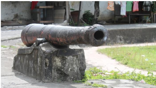
Fig. 9 Condition in Oranje Fort in 2014 (4)