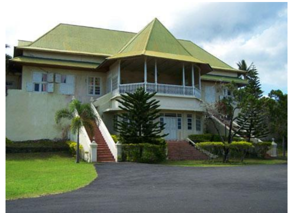
Fig. 12 Kedaton Ternate Museum

Kedaton Kasultanan Ternate Museum is proof of political, social and economic history and culture for the people. Kedaton is still awake and maintained and at certain times used to welcome guests or other customary activities. Kedaton Museum is also one of the tourist destinations for people visiting Ternate ( http://www.suararadio.com/wpcontent/uploads/2012/03/istana-kesult-Ternate-1.jpg ).