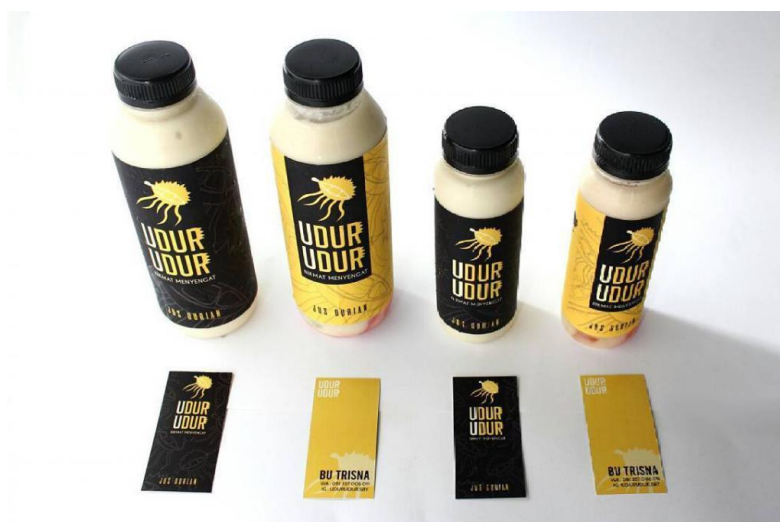
Picture 1 Udur-Udur Omah Duren Surabaya