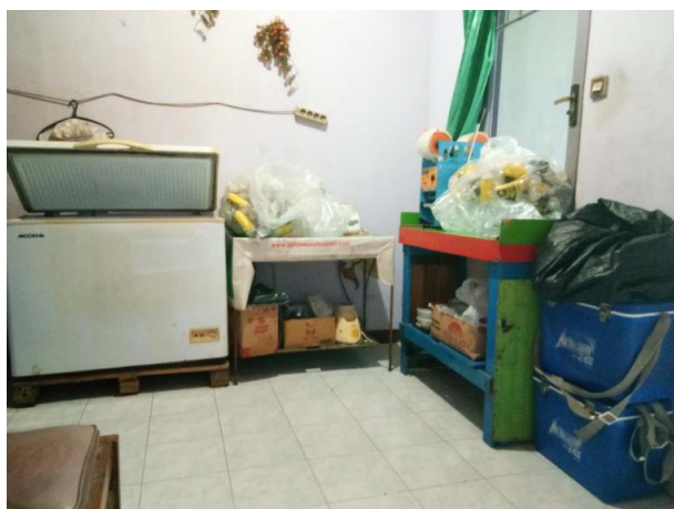
Picture 2 Omah Duren Production Places

After the order is taken, the owner is ready to make the production process. Production process of Udur-Udur starts from the purchase of raw materials to suppliers and to stalls. Raw materials consist of durian fruit meat, milk, sugar, drinking water and bubble. For durian and bubble as raw materials are ordered by the owner from different suppliers, and ordered a few days before the production process, usually ordered on Sunday. Owner buy milk, sugar and water when the stock is began limited at a nearby store. In addition preparing the raw materials, the owner also purchased bottles at a subscription store. Each week, the owner buys about 140 units of 250ml packaging bottle and 104 units of 500ml packaging bottles.