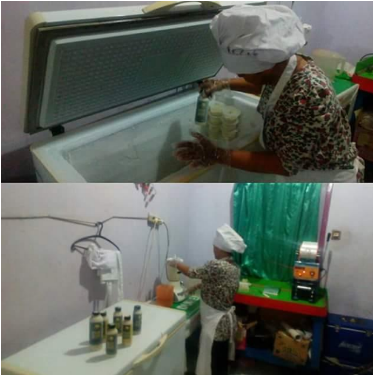
Picture 3 Omah Duren Production Process

The owner also performs sticker printing for packaging bottles. Each week, the owner prints stickers of 21 sheets of A3 sticker paper in the printing press. Out of 21 pieces, it is then divided into 14 sheets for the size of 500 ml, and 7 sheets for the size of 250 ml. After preparing the material, the owner performs the blending process of durian fruit, sugar, milk, drinking water until it becomes durian juice. Blending process is using two blender machines. The finished juice is ready to be inserted into the bottle of various sizes. Then, additional bubble into the Lite bottle before the durian juice is poured. The bottle that already filled with durian juice is closed, then juice left on the edge of the bottle is cleaned. After cleaning process, all the bottles of Udur-Udur are placed into the freezer. Udur-Udur requires special conditions for storage to last long, in example stored in the freezer for two months last. This also causes the owner to buy a freezer as a place of product display in several outlets and centers of SMEs.