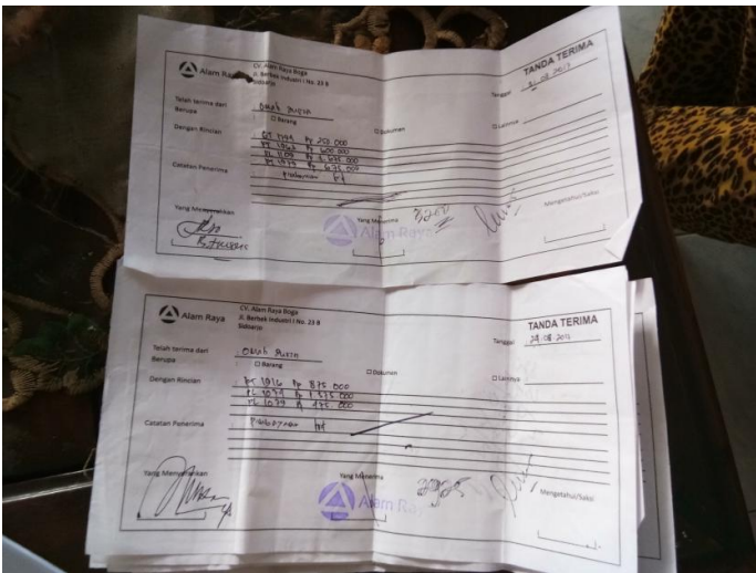
Picture 6 Merchandise Delivery Notes Proof