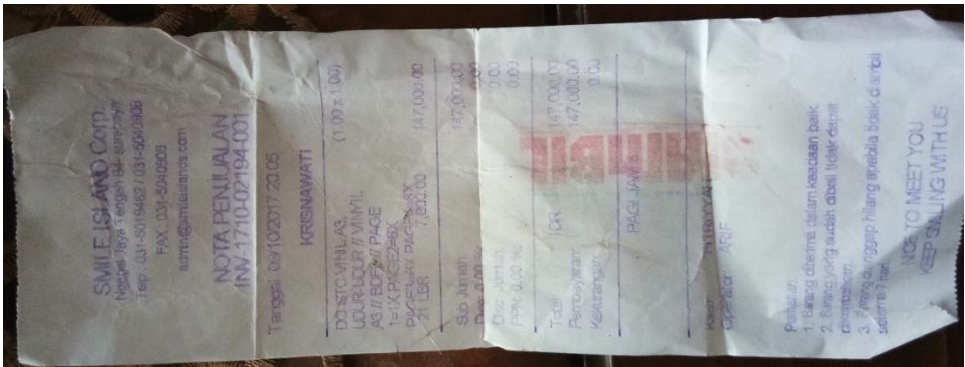
Picture 4 Receipt for Packaging Striker

In addition to raw materials, the purchase of packaging bottles should also get a purchase note, but sometimes the owner did not get it. Receipt evident for merchandise delivery, this evident is obtained from the delivery of merchandise to outlets and day care of SMEs center, because while delivery of goods, Omah Duren does not immediately get cash money.