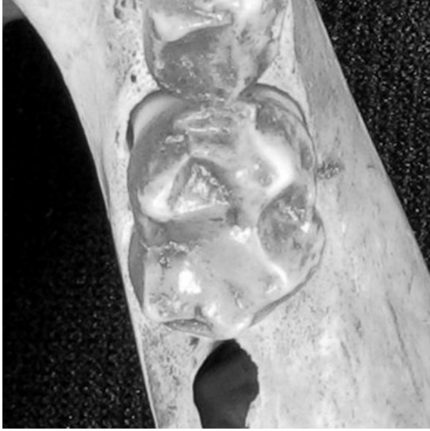
Fig. 3. Mid-trigonid and distal trigonid crests both scored as 3.

servations of ldp4 in humans, and the entoconid were examined for a division in the cusp. These were each scored as either present or absent. The protostylid coming off of the disto-buccal edge of the protoconid on ldp4 was scored from 0 to 7 following the ASUDAS. The expression of cusp 6 on ldp4 appears as a cusp on the distal margin of the tooth between the hypoconulid and the entoconid. This trait was ranked from 0 to 5 with the ASUDAS. It may be important to note that a small cusp 6 may resemble a divided hypoconulid but that a divided cusp should have a single split apex while a cusp 6 will have its own apex distinct from the apex of the hypoconulid. Additionally, cusp 7 appears as a small cusp on the lingual margin of ldp4 between the metaconid and entoconid. It was scored using the ASUDAS from 0 to 5 as well.