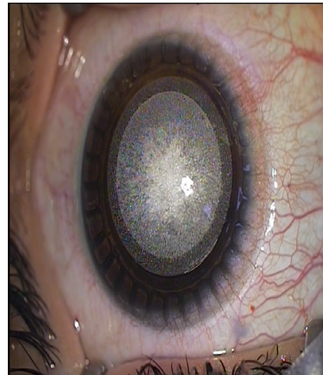
Fig. 1. This figure shows the different stages of the femtosecond laser applied during docking procedure for the correction of myopia or myopic astigmatism.

n : number of cases; UCVA: uncorrected visual acuity; BCVA: best corrected visual acuity; VAAS: visual acuity after surgery; VA3M: visual acuity 3 months after surgery; Y: Yates correction; F: Fischer exact test; NS: not significant at P > 0.05 ; S: significant at P \leq 0.05 .