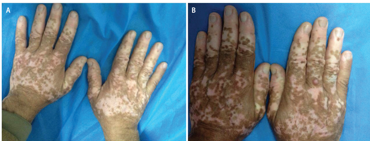
Fig. 1 A 57-year-old male with refractory acral vitiligo, (A) before treatment, (B) after treatment with fractional Er:YAG laser and NB-UVB showing good response.