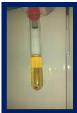
Figure (2): The result after the 2 nd Spin.

By using the same micro-pipette, PPP was drawn off and discarded, leaving approximately 1 ml of the fluid (figure. 3).