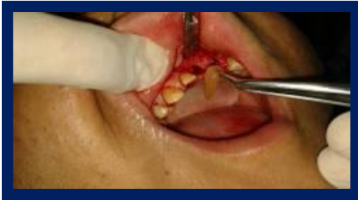
Figure (6): Application of PRP into the One Implant Site.

implant and two readings of the ISQ values were recorded; in a bucco-lingual and in mesio-distal directions.