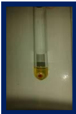
Figure (3): The Remaining of PPP and the Precipitated Blood Cells before Resuspension.

After that, the remaining fluid was resuspended before clinical use. This is the PRP. Now the PRP was pipetted and transferred into Eppendorf tube and stored at room temperature until implant procedure start (figure 4). Platelets were counted using a Cell Dyn Emerald hematology analyzer and ranged between 800,000 to > 1500,000/\mu l.