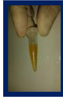
Figure (4): PRP Solution in Eppendorf Tube.

After that, the remaining fluid was resuspended before clinical use. This is the PRP. Now the PRP was pipetted and transferred into Eppendorf tube and stored at room temperature until implant procedure start (figure 4). Platelets were counted using a Cell Dyn Emerald hematology analyzer and ranged between 800,000 to > 1500,000/\mu l.