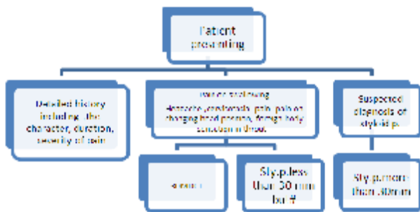
Figure 3: The criteria for selection of the patients

3D- MDCT is acquired to patient having longer than 30mm styloid process or fractured unilateral or bilateral and analyzed by brain trauma CT with elongation the field downward analysis with volume, coronal, sagittal reconstruction (Figure 3).