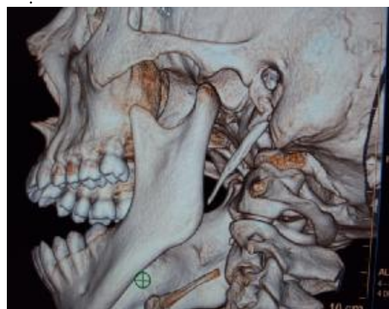
Figure 1: Elongation the styloid process of temporal bone

3D- CT is a valuable diagnostic tool in the diagnosis of Eagle's syndrome because of its ability to facilitate accurate measurement of the length of the styloid process and explain the problem in detail to patients, all of which make this technique superior to conventional imaging (19) .