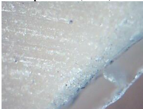
Figure 3: Photograph view of ground section shows occlusal one third of dye penetration (score 1)