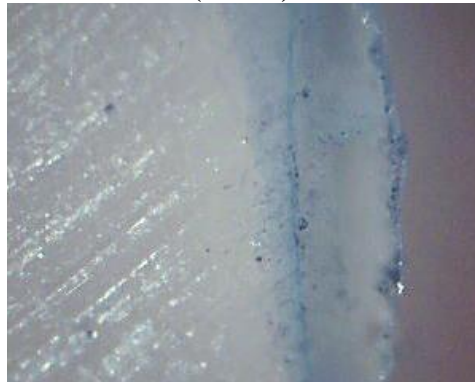
Figure 4: Photograph view of ground section shows dye penetration into middle third of the interface (score 2)