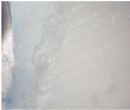
Figure 2: Photograph view of ground section shows clear enamel without dye penetration (score 0)