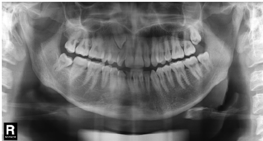
Figure 1: Panoramic Image Showing Unilateral Impacted Maxillary Canine

The researcher has examined the radiographs at the same time on hp- LCD screen (17 Inches) to determine the impacted tooth. Maxillary canines could be prevented from eruption by an obstruction on its path by an unexfoliated deciduous canine, an erupted permanent tooth, supernumerary tooth, odontome, alveolar bone, or soft tissue (as fibrous ridge mucosa). When the maxillary canine root was completed and it was not reaching its supposed position within the dental arch clinically and radiographically, it was defined as impacted.