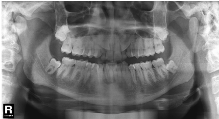
Figure 2: Panoramic Image Showing Bilateral Impacted Maxillary Canine