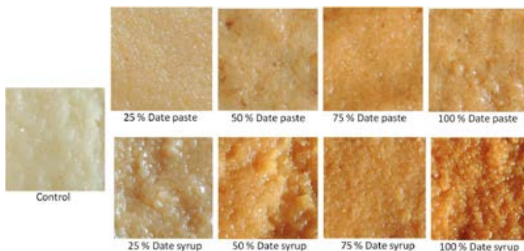
Figure 1. Visual aspect of kesari prepared with different concentrations of date paste and syrup as replacement for white sugar.