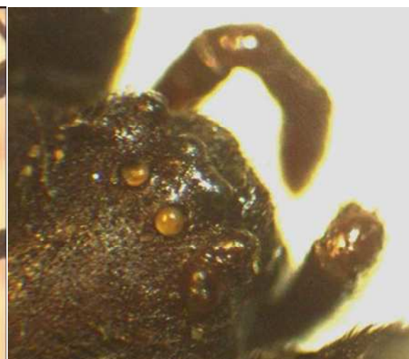
Fig. 3. Red-back spider's eyes pattern status