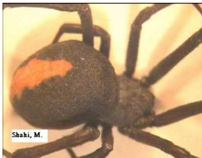
Fig. 2. Red-back spider collected from Bandar Abbas City, Iran, 2007