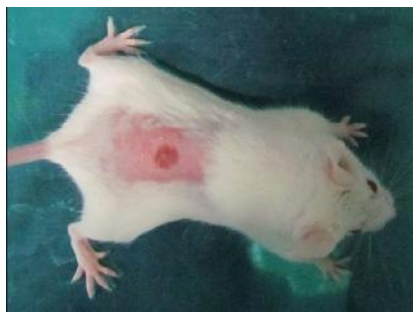
Fig. 1. Dermatitis induced by Paederus hemolymph on the back of mouse.