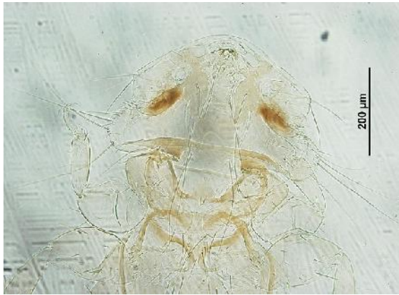
Fig. 10. Menacanthus sp, adult female, head, host: Ardea purpurea (Purple Heron) (original)