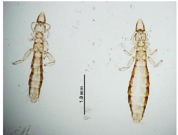
Fig. 7. Columbicola columbae , adult male (left), adult female (right), host: Columba livia (Rock Pigeon) (original)