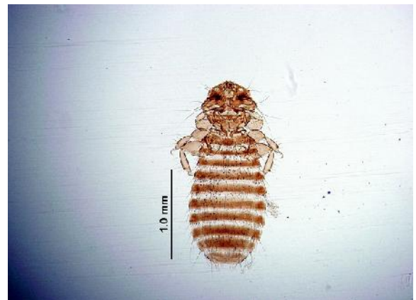
Fig. 2. Austromenopon transversum , adult female, host: Larus ridibundus (Black-headed Gull) (original)