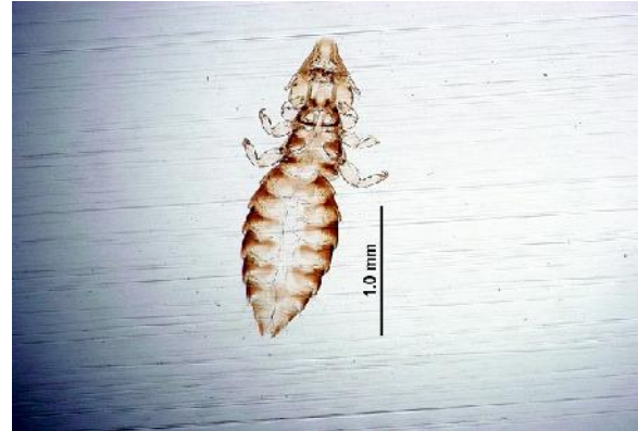
Fig. 1. Aqanirmus podicipis , adult female, host: Podiceps cristatus (Great Crested Grebe) (original)

Grebe: Podiceps cristatus , Locality: Nashtarood City, Mazandaran Province. This species is reported for the first time in Iran (Fig. 12, 13).