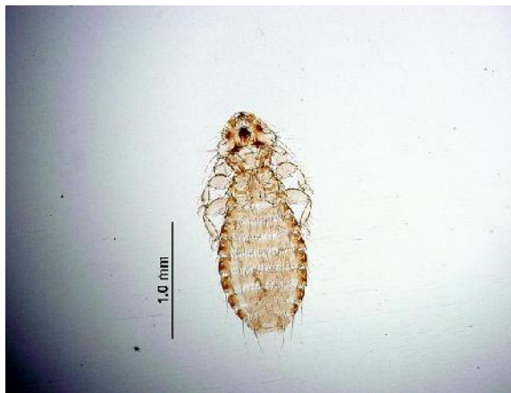
Fig. 12. Pseudomenopon dolium , adult female, host: Podiceps cristatus (Great Crested Grebe) (original)