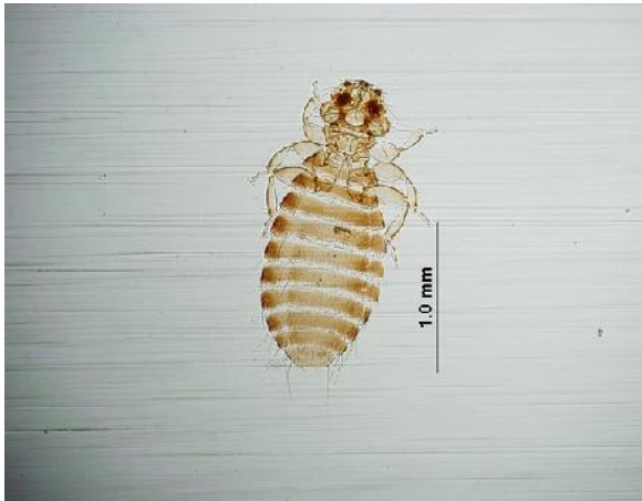
Fig. 4. Ciconiphilus decimfasciatus , adult female, host: Egretta garzetta (Little Egret), (original)