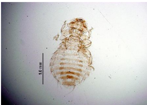
Fig. 8. Hohorstiella lata , adult female, host: Columba livia (Rock Pigeon) (original)