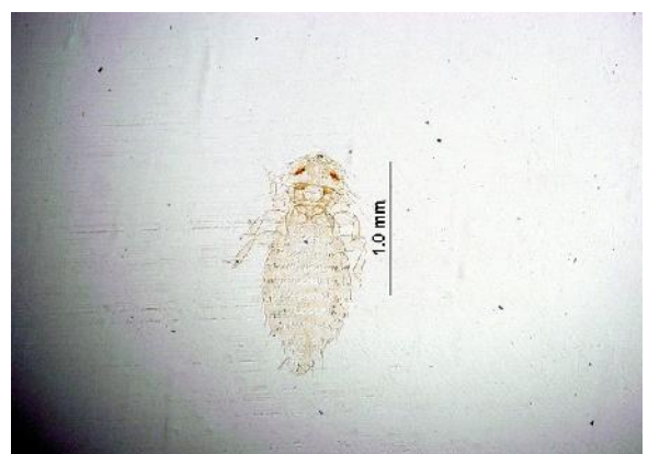
Fig. 9. Menacanthus sp, adult female, host: Ardea purpurea (Purple Heron) (original)