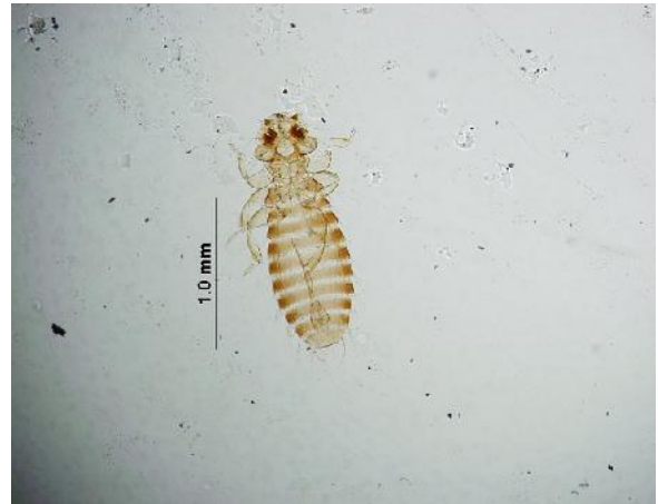
Fig. 5. Ciconiphilus decimfasciatus , adult male, host: Egretta garzetta (Little Egret), (original)