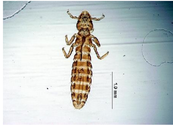
Fig. 11. Pectinopygus gyricornis , adult male, host: Phalacrocorax carbo (Cormorant) (original)