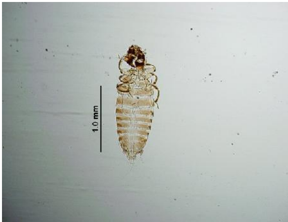
Fig. 6. Colpocephalum turbinatum , adult female, host: Columba livia (Rock Pigeon) (original)