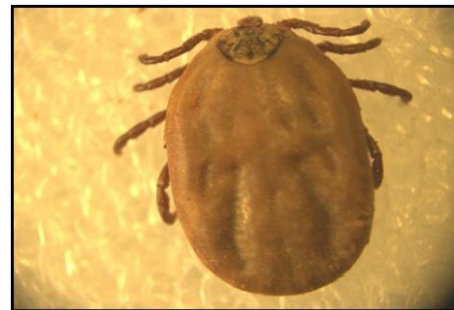
Fig. 4. Dermacentor raskemensis (Female)