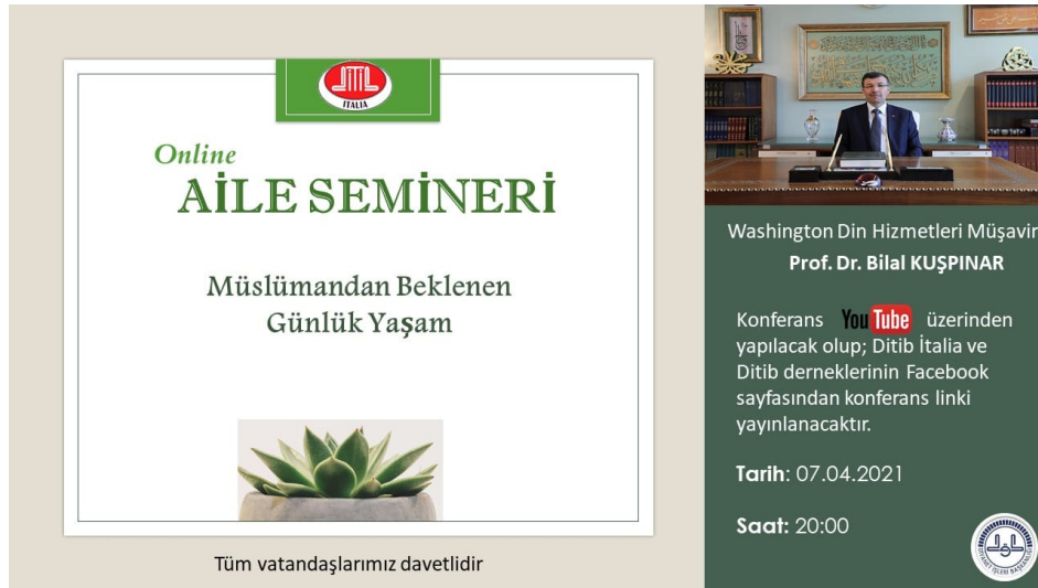
Figure 2. Poster of a webinar on Family, 'Daily life expected from a Muslim'

The extension of immigrant communities' physical boundaries 7 created a transnational virtual space in which representatives of Diyanet and of other diasporic communities could participate. Before the COVID pandemic, the limited economic resources and the relatively small-size communities did not allow the Italian branch of the DITIB to invite to Italy religious officers and speakers from abroad. However, the online seminars forged an international and transnational digital diasporic space which in Italy affected the Turkey-originated diaspora's perception of living in a peripheral diasporic context (Ince-Beqo, 2021). On the Facebook pages of the local DITIB branches all the information concerning the online seminars is posted regularly and the recorded videos of the meetings are available. Online seminars that hosted high-level religious officials employed at Diyanet's headquarters in Ankara were highly effective tools in making citizens feel the presence of the Turkish state. This is the case of the seminar titled "Marriage and Family Life" organized by the DITIB Milan branch whose invited speaker was the head preacher of the Diyanet in Ankara (Figure 3). In a similar fashion, the seminar