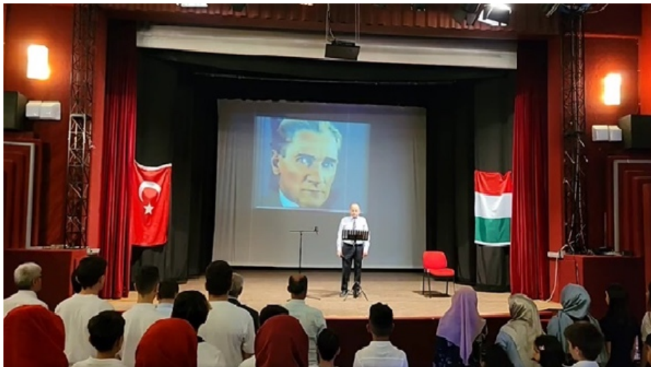
Figure 6. Farewell program to religious officers in DITIB Como

The event, attended by the Attaché, was also an occasion to present all the activities organized by the Como association in the past six years, stressing the COVID-related challenges, and to emphasize how they were in continuity with Turkey's long-lasting engagement vis-à-vis diaspora communities in Europe. In this view, the Turkish state's aim to not forget its citizens abroad and to preserve their belonging to the “Islamic civilization” ( Islam medeniyeti ) was operationalized through the building of mosques and cultural centers and the sending of religious officers from Turkey to Europe. In DITIB officers' speeches this notion of Islamic civilization is intertwined with national culture as an essential component of religion. This aspect is crucial in a migratory context considering that the DITIB is representing the Turkish Sunni interpretation of Islam, as the Attaché affirms: