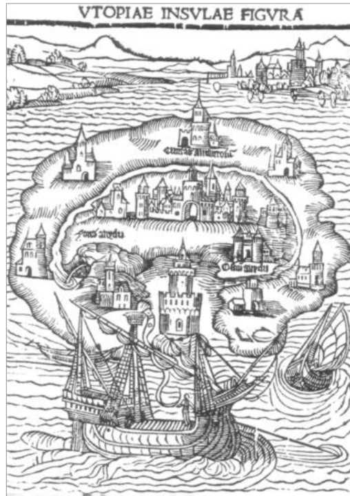
Fig. 3 Unknown (1516). Title woodcut for Utopia written by Thomas More.

Given the echoes of Moore's Utopia in Erewhon 's title, what spatial-topographic resonances might the two fictions sustain? Moore leaves the location of the island, somewhere between Old and New Worlds, open. Louis Marin, reflecting on Moore's construction of an indeterminate, middle place, notes that "Utopia" is itself a middle locale between the Greek term outopia (no place) and eutopia (good place) (1984: xvi).