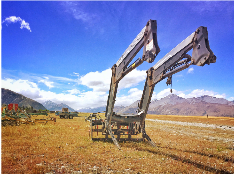
Fig. 1 Mesopotamia Station, Canterbury

Everything is like a door swinging backwards and forwards.