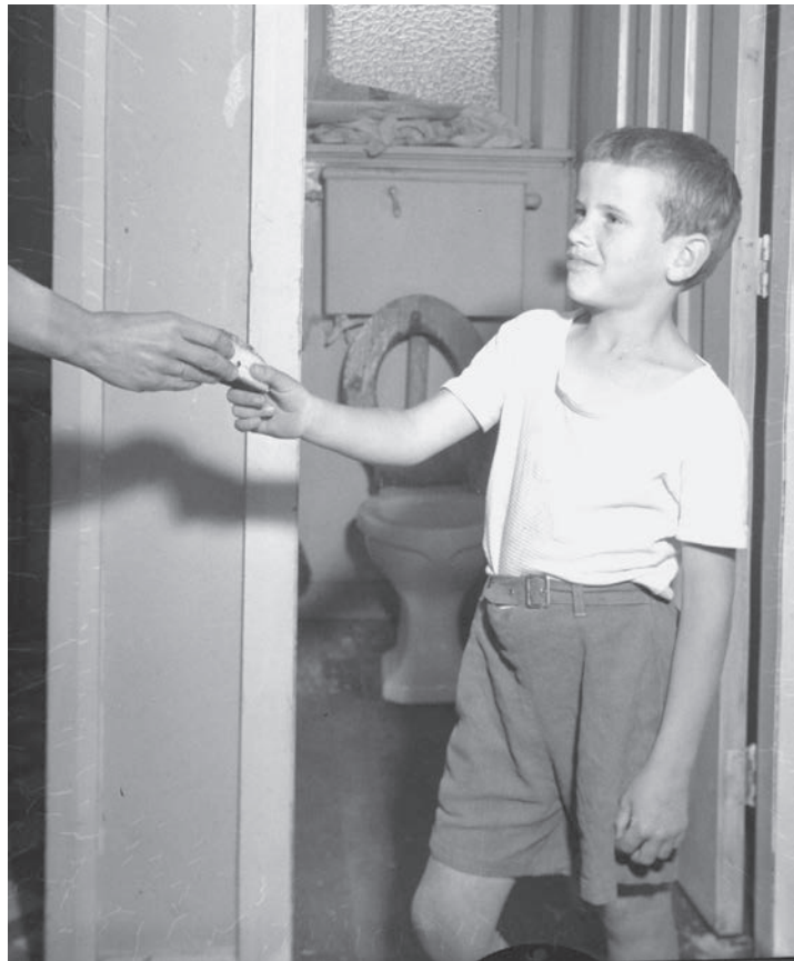
Figure 2: A boy being given soap to wash his hands after going to the toilet.

17. See note 5. In 1539, François, King of France, passed an edict that privatised his subjects' waste production. They were henceforth forbidden to toss out into the streets and squares "refuse, offals, or putrefactions, as well as all waters whatever their nature" and had