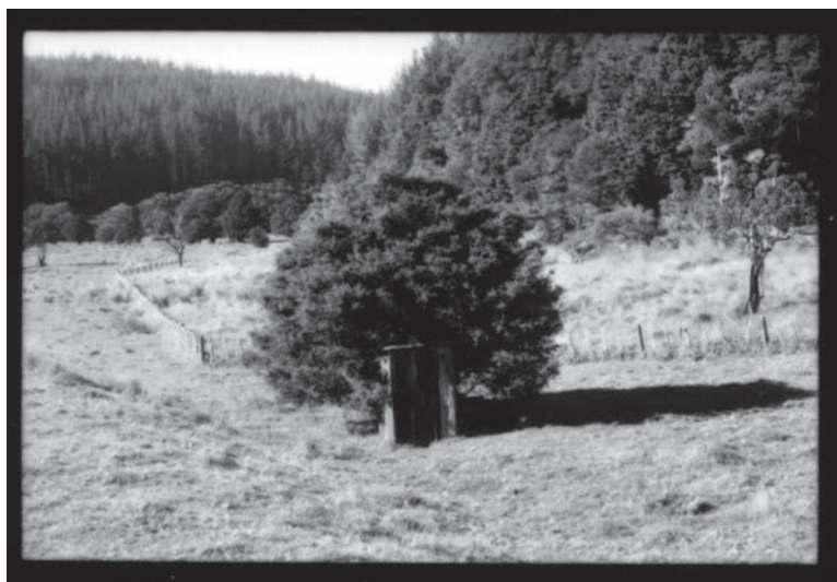
Figure 4: Daniel Malone, In Situ , Opouteke, Northland, Aotearoa/New Zealand, (Partially Covered Outhouse), 2004, Black and white photograph.

The water closet might have represented an achievement in nineteenth century Europe, with its particular problems of over-crowding. But a peculiar myopia excluded from perception historical and geographical particularities such as the vast difference between the metropolises and the hinterland in Europe, or earlier observations of barbarians and civilised such as Hawkesworth's notes about hygienic conditions in Anaura Bay in 1769. These lapses of historical and geographical awareness supported a particular ideological system by which one type of toilet comes to mean something different from another, in peculiar ways. The perception of the