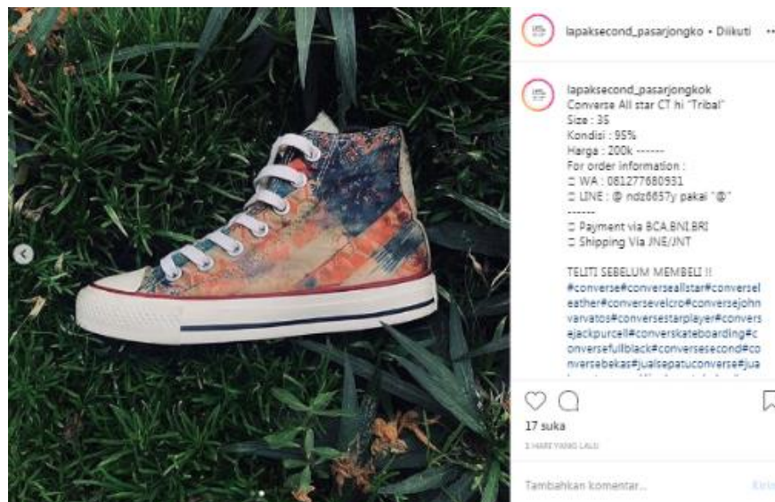
Figure 3. Display images of products with low price information

Entrepreneurs must have consideration in choosing a product or see other market prices that have similarities in product sales. In the post, there is clear information in the picture starting from the name of the item, size, price, number that can be contacted, and the method of payment. It can be seen, such as an affordable price offer with good quality being the selling power for Lapak Second Pasar Jongkok (see Figure 3).