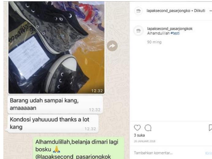
Figure 4. LSPJ chat rooms and testimonials

people and consumers. Besides, this direct interaction is also used to carry out testimonials on Lapak Second Pasar Jongsok services and products (See Figure 4).