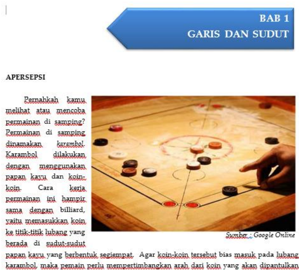
Figure 1. The "Apperception" section of the SMART Book

This research is an experimental SMART Book textbook that has been developed previously. What distinguishes this book from mathematics or other geometry books? First, the SMART Book gives a very easy apperception to readers in everyday life and is assisted with relevant images at the beginning of each chapter (Figure 1).