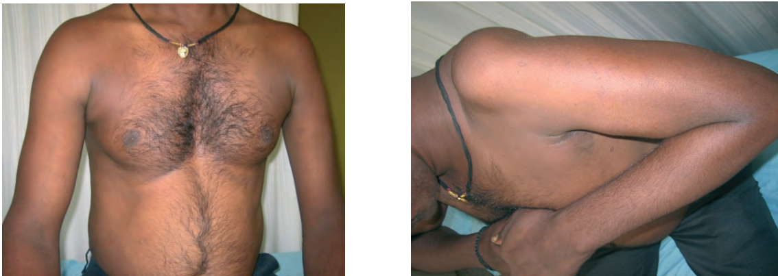
Fig. 1. Photographs displaying atrophy of the proximal aspect of the left upper limb with loss of contour of the left shoulder.

Motor nerve conduction study showed reduced Compound Motor Action Potentials (CMAP) amplitudes in left axillary, musculocutaneous and infraspinatus, but the sensory nerve conduction was normal. Cervical spine contrast enhanced MRI revealed mild loss of cervical lordosis, but no features of HD like localized cord atrophy, loss of attachment of dura from subjacent lamina on neutral position axial T2WI MRI, nor any presence of posterior epidural crescentic enhancing mass on flexion contrast sagittal T1WI MRI (Fig. 3). The patient was managed with supportive therapy and has been under regular follow up ever since. His clinical status has been stable.