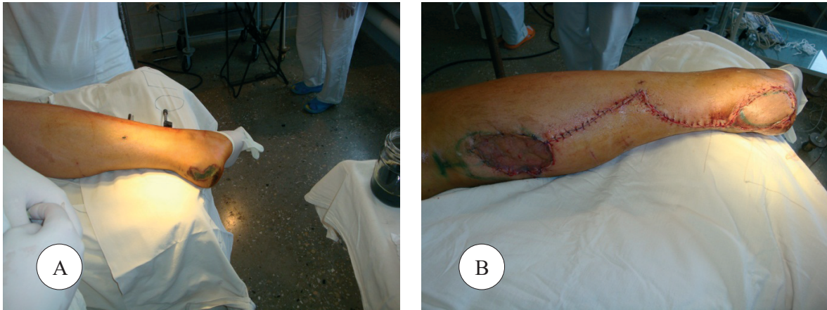
Fig. 2 A, B. Plastic wound defect with five islet flaps with a nourishing stalk (S. S., Case No 20414).

maged skin and underlying tissues to deep fascia, the flap with a nourishing stalk was not used because of the lack of indications for reconstructive interventions.