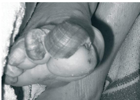
Fig. 2. Total nail dermatophytosis (Tr. Rubrum), polyonychomycosis. Big polyonychial gryphosis. Clinical case. 82-year-old man.