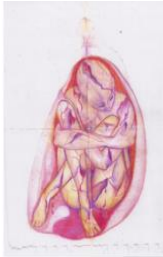
Figure 2. In Front of the Mirror