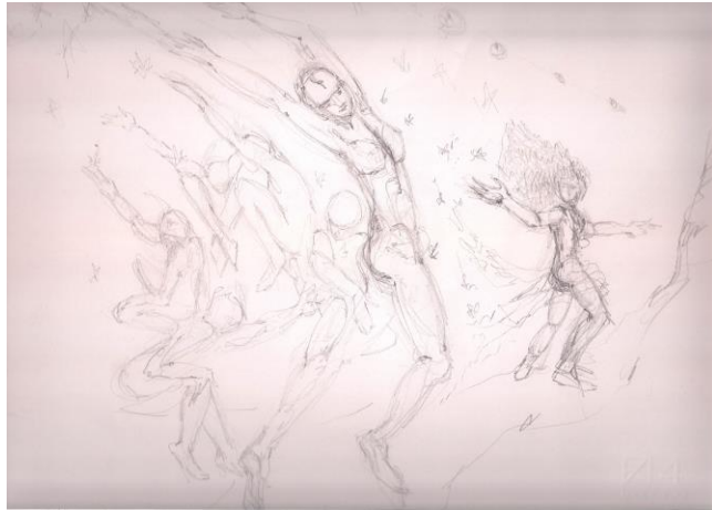
Figure 5. Journey of the Self