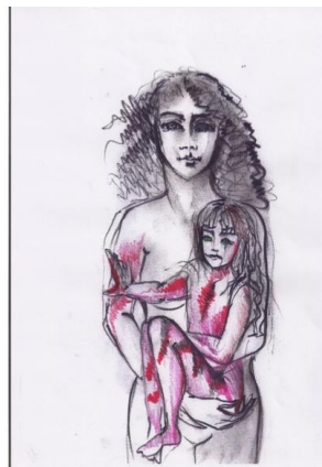
Figure 3. Reliance