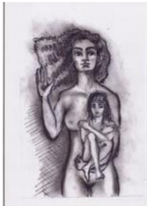
Figure 4. The Healing Process

During the first 4 years of the therapy, we worked on the need for protection and depending on someone (Figure 4) by relying on interposition and supportive regressive therapy (O'Reilly-Knapp & Erskine, 2003). When Stella rested her head in my lap, a position she loved and often chose, she would often be at odds with herself. "Can we do this?" she would ask. "It makes me feel like criticizing myself. I think that I do not need it, I am acting like a little girl. ... Well, since this kind of contact makes me feel good, that's it!" The regressive work (Erskine, 2008) of leaning toward me and enjoying my warm embrace always made her extremely happy. She had finally found a tender mother.