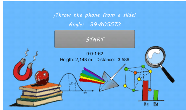
Figure 2. Serious Physics: Uniformly Accelerated Linear Motion experiment

As long as it is necessary to know the value of the radius in this equation, it will be provided by the user of the application. As it happened in the experiment of Uniformly Accelerated Linear Motion, the user has to indicate the start of the experiment and then the application will start counting the time from the moment it detects movement (this time measuring procedure ends automatically when the mobile device stops completely). After completing a test, the application provides the angular velocity ( \omega ) in