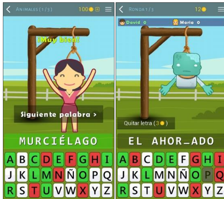
Fig. 5. Hangman game with two different words

It only has one game mode, but it contains around 30 different categories, which contain approximately ten words each, which translates into approximately 300 words available to play. Figure 5 shows the game, displaying the category to which the word belongs, the number of spaces that correspond to the number of letters and a space where the hangman will be appearing; each word has eight attempts.