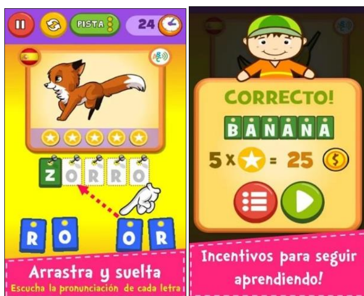
Fig. 4. Activity to complete words by dragging letters

Christmas, Home, Tools, Vehicles, Holidays and Instruments. The game shown in Figure 4 consists of completing words by dragging the letters that compose them. Depending on the level of difficulty, the word to be completed will be shown; it will be displayed in the boxes with transparent letters. The system contains a voice assistant that reads the selected words and letters, in this case the assistant does not give instructions to the user.