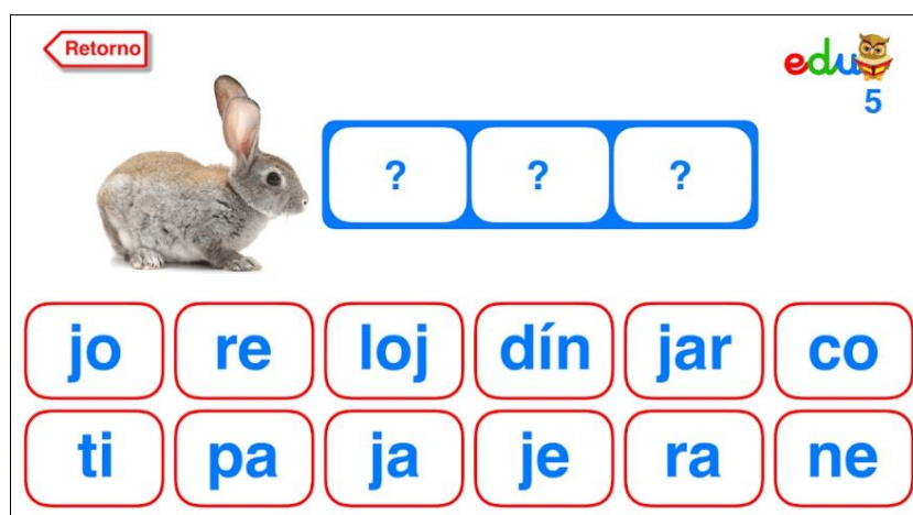
Fig. 3. Activity to drag all the syllables that compose a word

The first exercise consists of selecting the first letter of a word, which is related to an image. The second exercise consists of selecting the first syllable of a word, which is related to an image again. The last activity is to select all the syllables of a word. Figure 3 shows the arrangement of the elements of this activity; in this case, the child must select three syllables, from the set of syllables below the image.