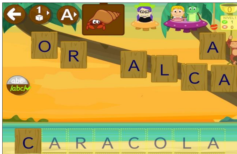
Fig. 1. Activity to drag letters to the corresponding boxes