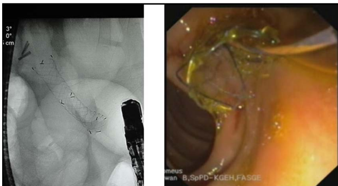
Figure 3. SEMS.