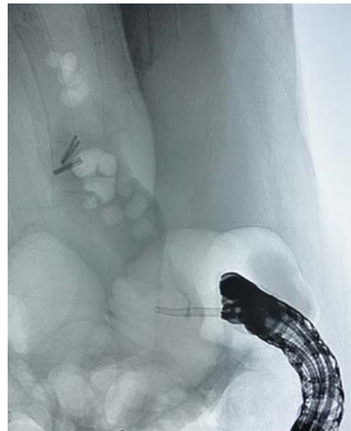
Figure 1. CBD Cannulated via CDF with Multiple Biliary Stones.

CDF was one of the rare conditions reported. A study presents 81 biliary fistula cases from 1948-1998 and choledochoduodenal fistula was only found in 7 cases (8.6%). 7 The most common cause of CDF was cholecystolithiasis. 1,6 Some reported CDF was caused by duodenal ulcer, tumors, and tuberculosis. 6,8 In a study reviewed in the period between 1976 and 1989, 14 (0.7%) patients who underwent ERCP because of biliary disease were found to be having CDF. 9 Another