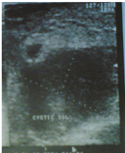
Figure 1. Ultrasonography of breast showed hypoechoic lesion with multiple internal echoes

Thick pus of about 100 ml was drained out. Pus was sent for acid fast bacilli stain and culture test which came negative. On histopathology, to our surprisingly, diagnosis made as breast tuberculosis ( Figure 2 ). Patient was put on anti tubercular drugs (rifampicin 600 mg, isoniazid 300 mg, pyrazinamide 1500 mg and ethambutol 1000 mg per day) was initiated for 2 months and continued with the addition of rifampicin and isoniazid therapy for an additional four months. In follow up of 3 months, patient recovered very well and advised to continue treatment.