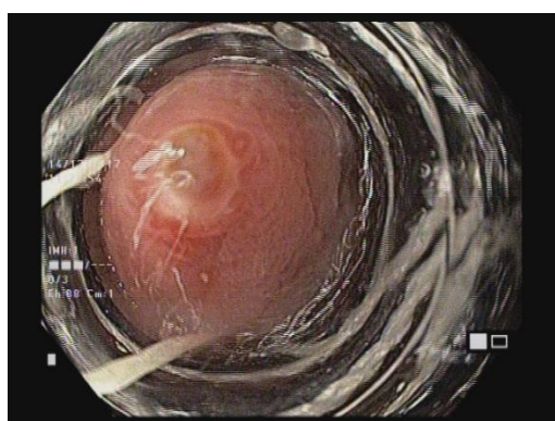
Figure 3. Rubber band ligation of Dieulafoy lesion.