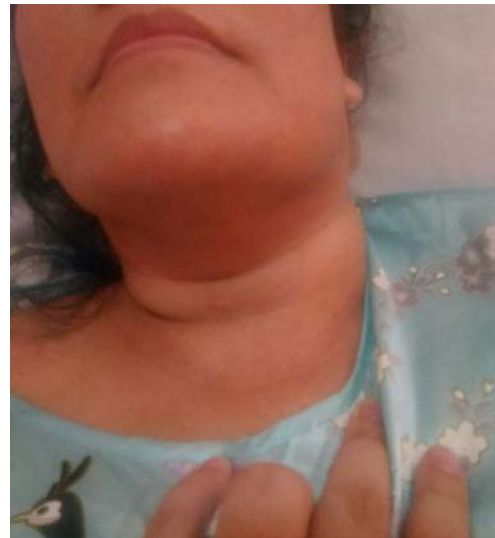
Figure 3. Anterior view of the neck in a patient with a thyroid abscess at the left lower pole