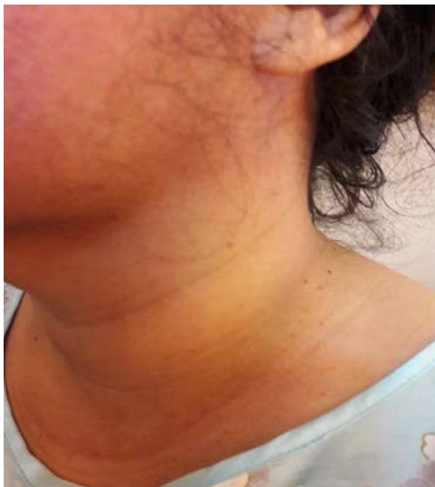
Figure 1. Lateral view of the neck in a patient with a thyroid abscess at the left lower pole