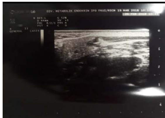
Figure 4. Neck ultrasound