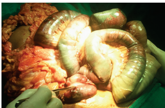
Figure 1. Intraoperative picture showing gangrene of major part of small bowel and caecum.

A 45-year-old female, presented with acute abdominal pain, vomiting and abdominal distension of one day duration and clinical features suggestive of intestinal obstruction and hypovolemic shock. Four days prior to her current presentation she passed dark loose stools. Her past medical history was significant for paraumbilical hernioplasty two years ago. At the time of admission, pulse was 130 beats/min, blood pressure was 86/50 mmHg, and respiratory rate was 36/min with cold extremities. Total leucocyte count was 39,0000/cu mm and creatinine 2.39 mg%. A plain erect abdominal radiograph revealed multiple air-fluid levels, thereby suggesting strangulation following obstruction of the intestines most likely due to adhesions from her previous surgery. She was taken to operation theatre for surgical treatment of her intestinal obstruction. During exploratory laparotomy, foul smelling dark coloured fluid was found along with gangrene of large part of small intestine, cecum and the proximal part of the ascending colon with intervening normal gut. ( Figure 1 ). There was no evidence of adhesions or any other evidence of mechanical obstruction. A right hemicolectomy with resection of major part of small bowel was performed leaving approximately one feet of proximal jejunum ( Figure 2 ). The jejunum was brought out as jejunostomy and the proximal end of the transverse colon was brought out as colostomy