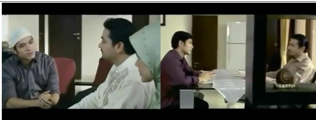
Figure 2. Screenshot of DMC film DMC at 43.46 minutes (left) and 50.19 minutes (right).