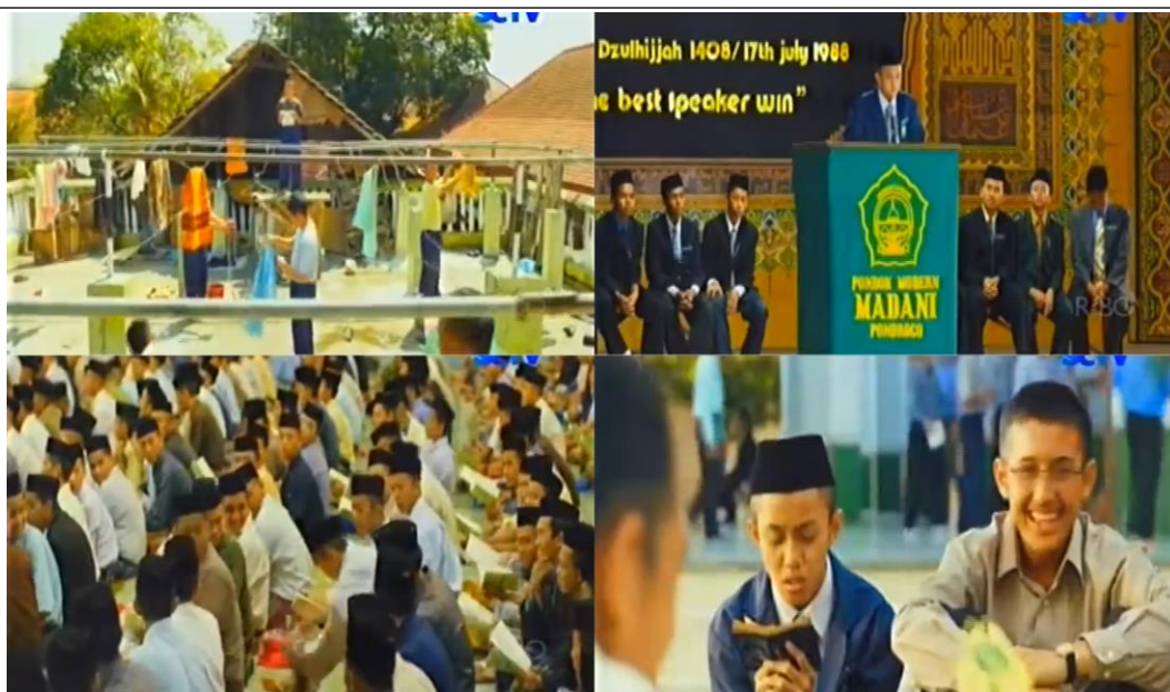
Figure 3. Film Screenshots of N2M film at minutes 40.14 (left above), at minutes 41.57 (right above), at minutes 41.32 (left below), and at minutes 43.20 (right below).