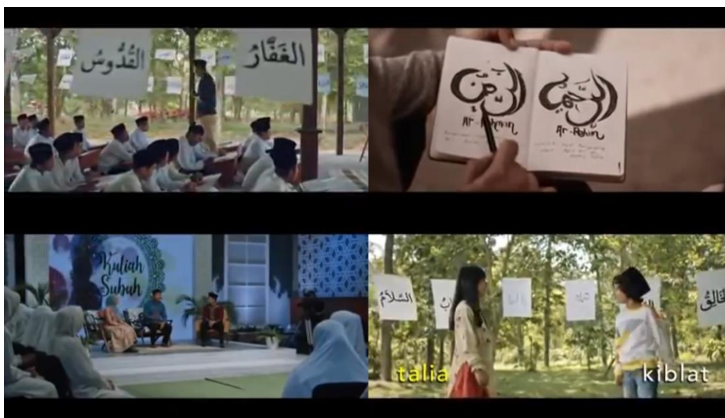
Figure 4. The screenshots in 99 Nama Cinta film at 15.51 minutes (left above), at 46.13 minutes (right above), at 1.05.10 minutes (left below), at 1.43.33 minutes (right-below).