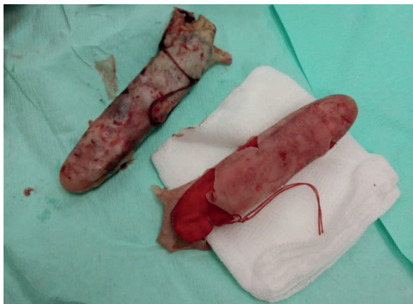
Figure 2: Nasal packs, enveloped with an outer layer using glove, after removal from the stomach.