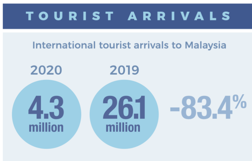
Figure 3. International tourist arrival patterns in COVID-19 pandemic outbreak (Malaysia, 2022)

In 2020 (see Figure 3.), the overall tourism industry was hardly affected by the COVID-19 pandemic, with an estimated decline to -83.4% of total global tourists arriving in Malaysia from previous 2019 (Malaysia, 2022) . These are the significant challenges faced by Malaysians to increase the tourism industry in the next few years of Post-Pandemic. In order to increase this, Malaysians can enhance halal tourism promotion through the strategic transformation. Based on the Tourism Malaysia Strategic Planning 2022-2026, there are four strategies to do: 1) promotion domestically, 2) promotion internationally, 3) communication which integrates public relations and corporate communication, and 4) communication which covers information digital and advertising.