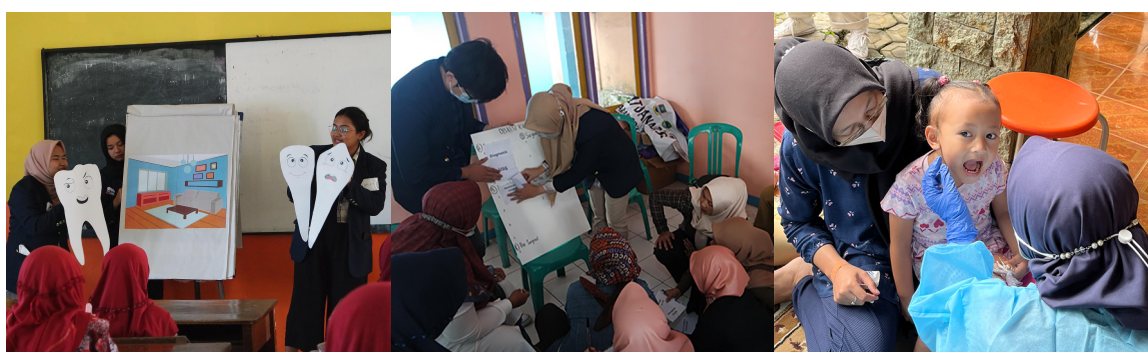
Figure 1. a. Oral health education session at Jambudipa I elementary school; b. Focused group discussion session on dealing with babies born with cleft; c. Dental consultation at the Posyandu in Jambudipa village.

Each school took a day in execution. The 15 students were divided into three classes per school and the oral health education was conducted using flip charts, children's songs and storytelling. Before starting the storytelling session, school children were given a test on the material to be delivered, followed by a post-test using the same questions and an evaluation of their reactions. The storytelling provided material about dental and oral health methods to make it easier to understand and create a more interactive atmosphere, as well as short quizzes, games and assessments ( Figure 1a ). The activity was concluded with step-by-step practice on how to brush teeth properly. Each session lasted for two hours. In total, after seven days of training, 867 school children received oral health education. These learning sessions attracted the attention of the dental related corporations, which gave their support by providing the toothpaste and toothbrushes that were given to the students.